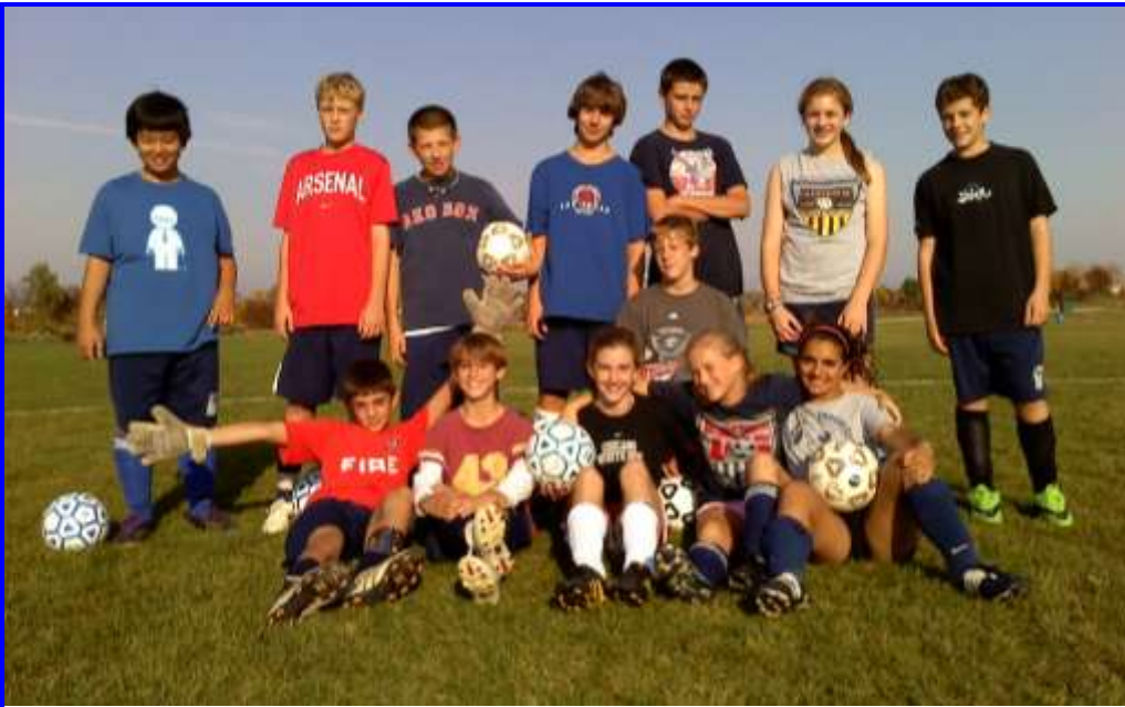
Attea 7th Grade Soccer Team